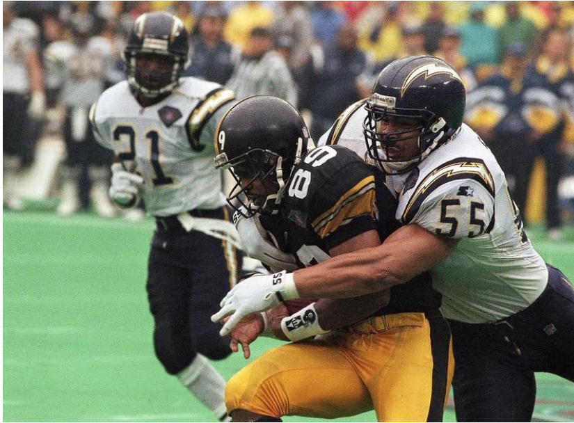
San Diego Chargers linebacker Junior Seau tackles Pittsburgh Steelers wide receiver Ernie Mills during the 1995 AFC Championship in Pittsburgh.

It's those kinds of intertwined symptoms of aggression, mental health problems and confusion — which can often strike former players well before a formal dementia diagnosis — that objectors say the settlement doesn't properly address.