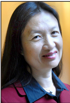
NAN WU COOLEY LLP SAN FRANCISCO